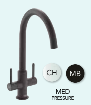
Rosolina J Spout CHROME UPGRADE + £100 MATT BLACK UPGRADE + £120