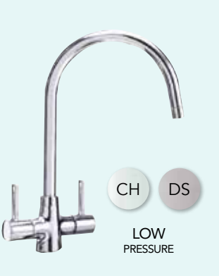
Alba CHROME UPGRADE + £50 DECOR STEEL UPGRADE + £55