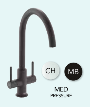
Rosolina J Spout CHROME UPGRADE + £100 MATT BLACK UPGRADE + £120