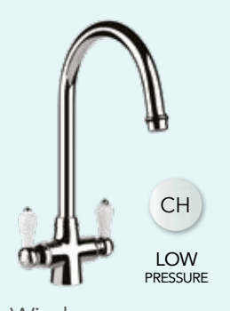
Windsor CHROME UPGRADE + £60